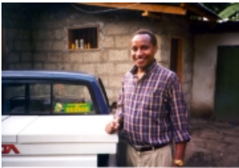
Brother and truck K A __ na G A __