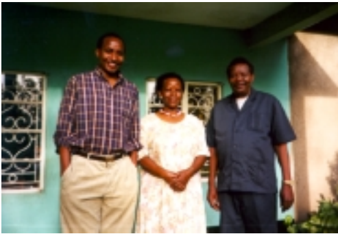
Brother, Mother and Father K A __ ,M A __ na B A __