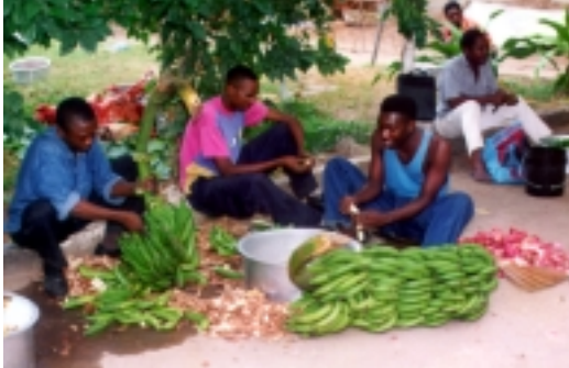
Banana - N D I _ _