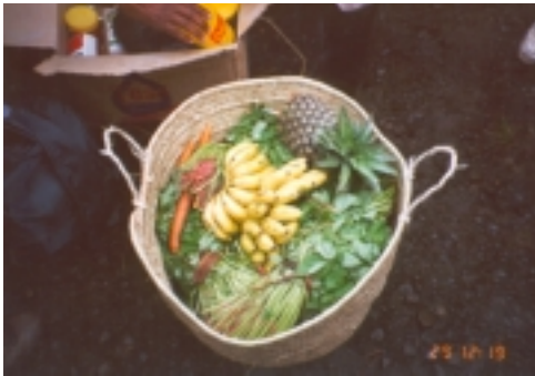
Fruits and vegetables M A T U _ _ _ na M B O _ _