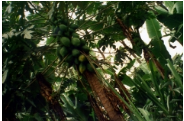
Pawpaw and banana trees miti ya MAPAPAI na NDIZI