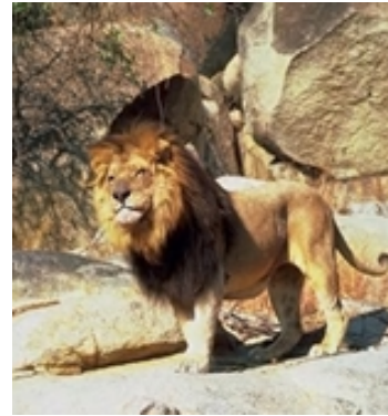
Lion S I M _ _