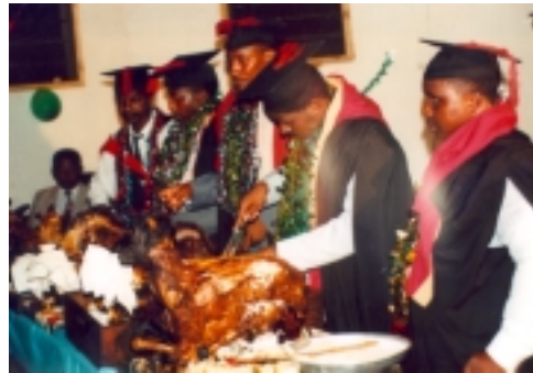
Goat (Ceremonial food, like Turkey) M B U _ _