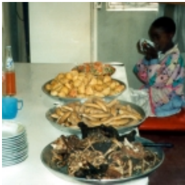
Potatoes, bananas and meat(Goat) VIAZI, NDIZI na NYAMA(mbuzi)