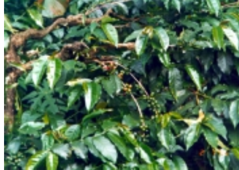
Coffee - K A H A _ _