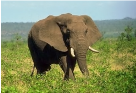
Elephant T E M _ _